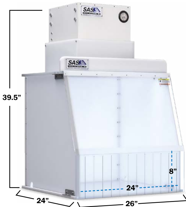
Dimensions are approximate