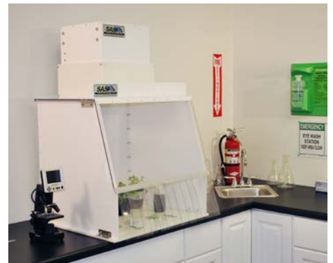
24" PCR provides a clean workspace for tissue culturing.