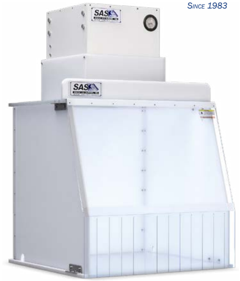
24" Portable Clean Room Hood