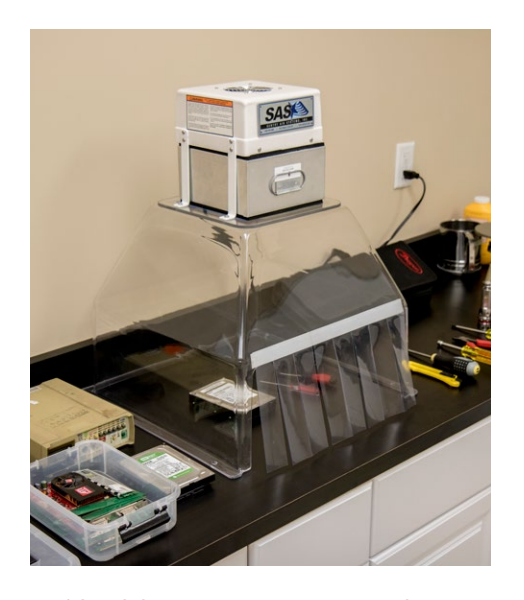
18" ISO-Pure Mini Portable Clean Room can be a compact solution for data restoration.