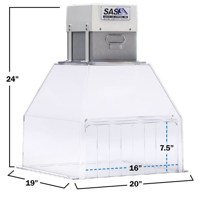
Dimensions are approximate