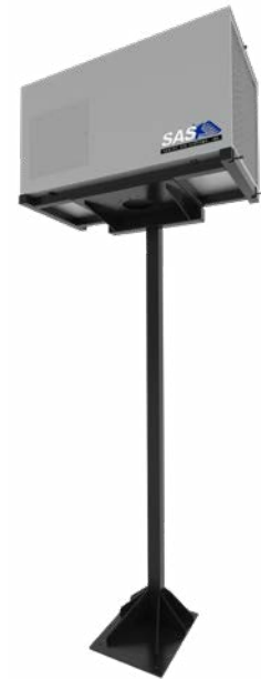
Model 2000 Air Cleaner mounted on Fume Extractor Stand [SS-091-FES]

In-house factory testing in a 40,800 ft 3 workshop in Houston, TX indicated an 87% reduction in airborne particulate after 50 minutes with two model SS-2000-FH units.