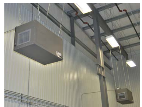
Model 2000 Air Cleaner can be mounted in several ways including hanging from the ceiling.