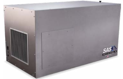
Model 2000 Free-Hanging Air Cleaner

The Model 2000 Free-Hanging Air Cleaner provides high efficiency dual-stage industrial air filtration for ambient air cleaning and the removal of airborne pollutants without the assistance of external ducting. This system can be mounted a variety of ways: hang from the ceiling, fume extractor stand, or placed on a table. This self-contained unit can be conveniently mounted in the customer's desired ceiling location without taking up any floor space. This unit can also be mounted on a fume extractor stand [SS-091-FES] when ceiling mounting is not feasible. This system can also be placed on a table to be closer to the source of the fumes and particulate.